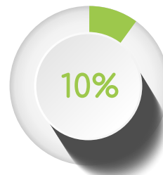
Alignment of Existing Initiatives, Best Practices, and Partnerships With 2030 Global Sustainability Strategy (February - October 2024)