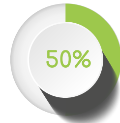
Workshops to Develop Strategic Actions For 2030 Global Sustainability Strategy (May - October 2024)