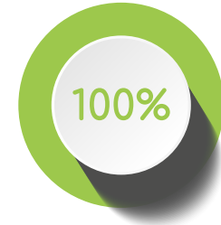
Development of Strategic Pillars and Focus Areas (December 2023 - February 2024)