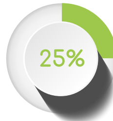
Alignment of Existing Initiatives, Best Practices, and Partnerships With 2030 Global Sustainability Strategy (February - October 2024)