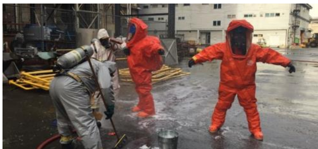
Emergency Response Team (ERT) members perform decontamination of a Hazmat entry team during a SO 2 release exercise.