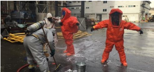
Emergency Response Team (ERT) members perform decontamination of a Hazmat entry team during a SO 2 release exercise.